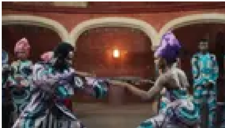
Ikon Gallery, Hetain Patel 'Dont Look At The Finger' (2017). Single Channel HDVideo.

Ikon Gallery in Birmingham have teamed up with macLYON in Lyon to present “ Friends in Love and War – L'Éloge des meilleur·es ennemi·es ”, featuring works by more than twenty artists from the British Council Collection and macLYON that explore the meaning and role of friendship in contemporary life.