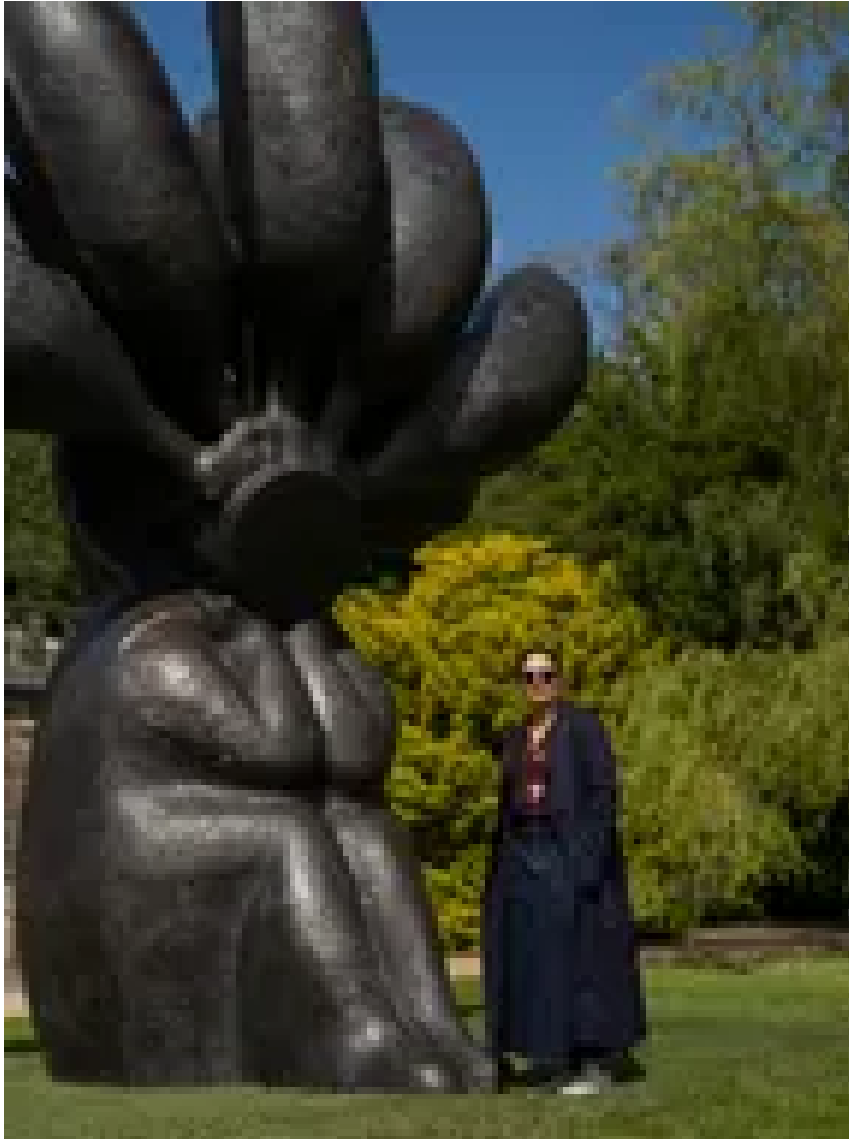
Bharti Kher with Djinn 2024, Courtesy the artist, Hauser Wirth, Nature Morte and Perrotin. PHOTO COPYRIGHT JONTY WILDE, COURTESY YORKSHIRE SCULPTURE PARK.

Bharti Kher continues her sculptural exploration of the female body and experience with “Alchemies” at Yorkshire Sculpture Park (YSP). “Alchemies” is Kher’s her largest UK museum show to date and is curated across the YSP Underground Gallery and surrounding garden, and includes four significant outdoor bronze sculptures. Bharti Kher was born in the UK and now lives and works between London and India. “Alchemies” looks at issues of gender and identity, touching on ideas of metamorphosis,