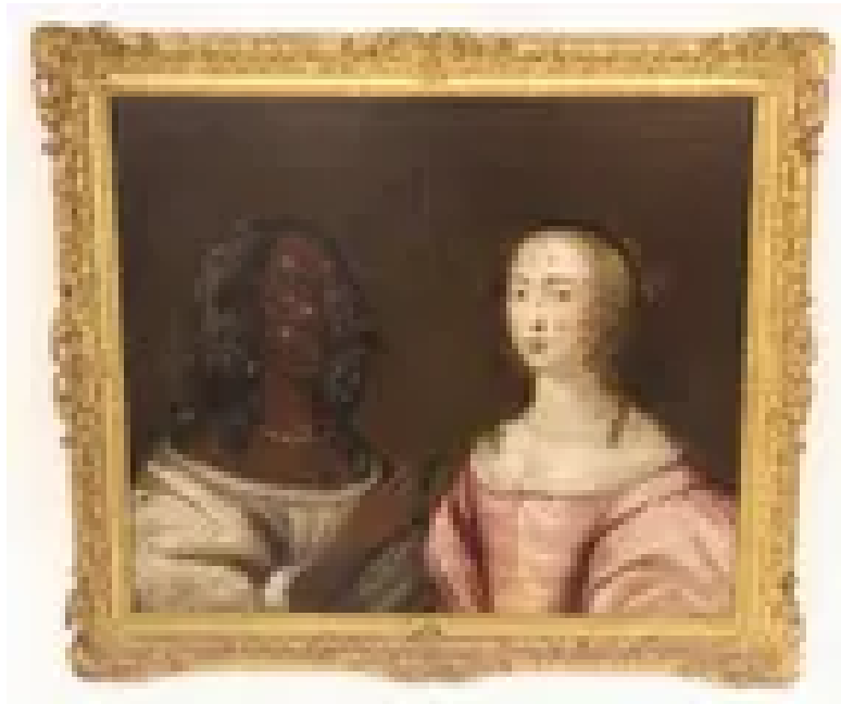
"Two Ladies", Courtesy of Compton Verney. COPYRIGHT COMPTON VERNEY.

Compton Verney , an 18 th Century country estate in Warwickshire with sculpture garden and art gallery, is presenting “Spectacular Diversions”, a major exhibition of works by Chila Kumari Singh Burman. The exhibition includes sculpture, drawings and prints, as well as a series of her signature neons that light up the façade of the historic house depicting animals, ice creams, Hindu deities and mythological creatures. Also on public display in the UK for the first time is “Two Women Wearing Cosmetic Patches” (c.1655), a painting that was saved for the nation in 2023 before undergoing an 18-month conservation and research project at the Yale Center for British Art. Compton Verney purchased the painting by an unknown artist