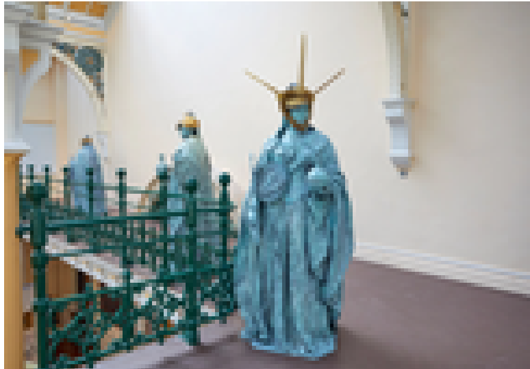
Installation view of Deviance & Difference at Birmingham Museum & Art Gallery.

Deviance and Difference at Birmingham Museum and Art Gallery (until 8th December, 2024).