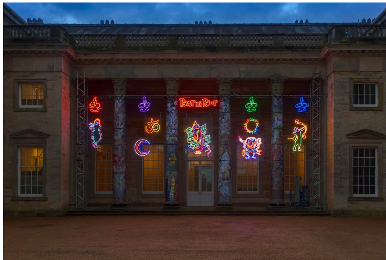
Installation view, Chila Kumari Singh Burman.

London is a veritable hotbed of museums, galleries and cultural attractions, so exhibitions in the capital tend to get the Lion's share of coverage. Yet there are so many amazing exhibitions in arts institutions, museums and stately homes with galleries and sculpture gardens outside of London worth visiting. I picked out my highlights to see this winter.